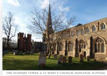
THE DEANERY TOWER & ST MARY'S CHURCH, HADLEIGH, SUFFOLK