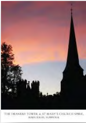
THE DEANERY TOWER & ST MARY'S CHURCH, HADLEIGH, SUFFOLK