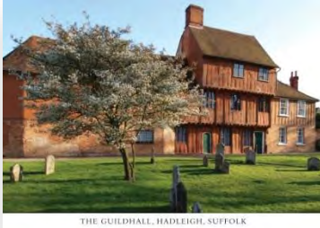
THE GUILDHALL, HADLEIGH, SUFFOLK