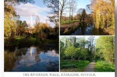
THE RIVERSIDE WALK, HADLEIGH, SUFFOLK