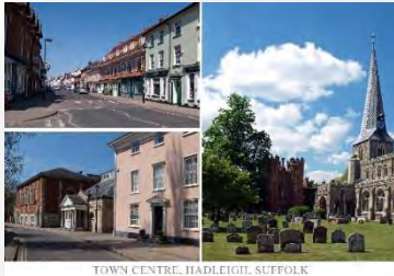
TOWN CENTRE, HADLEIGH, SUFFOLK