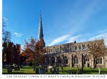
THE DEANERY TOWER & ST MARY'S CHURCH, HADLEIGH, SUFFOLK