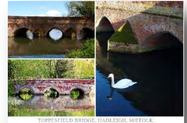
TOPPESFIELD BRIDGE, HADLEIGH, SUFFOLK